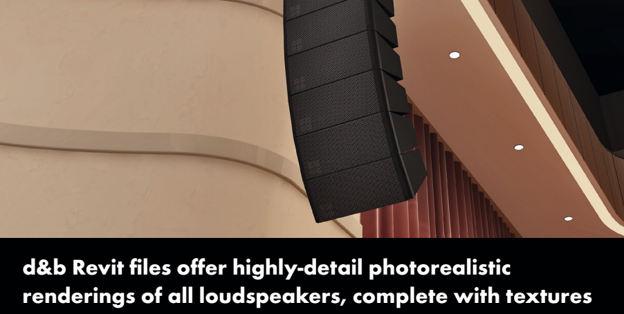
and appropriate accessories.

d&b Revit files are available to download from www.dbaudio.com